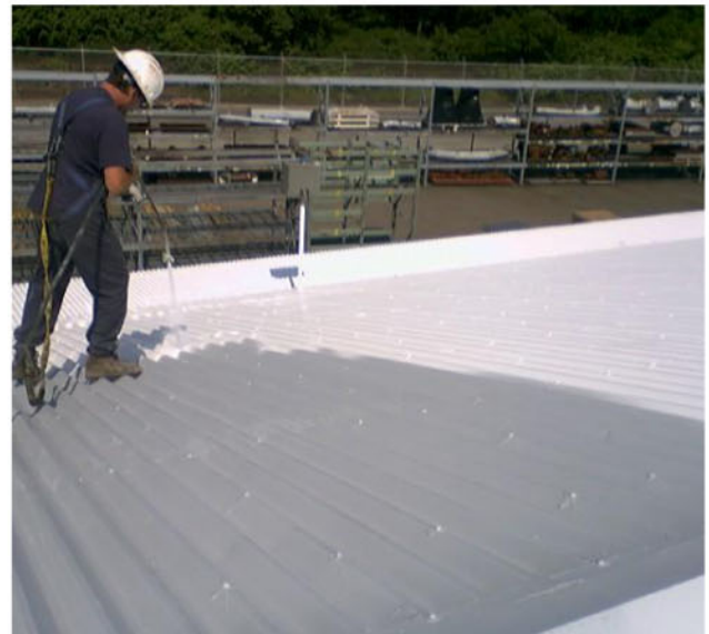
Power cleaned roof meets Topps Seal rubber.

Temperatures on a roof like this can drop as much as 40° F. immediately after cool white Topps Seal™ rubber is installed.