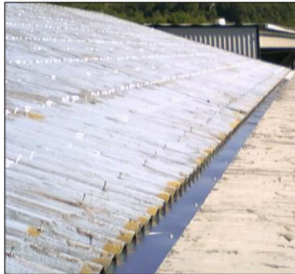
Original metal of the original Reliant roof.

Reliant Energy is one of the nation's largest independent power producers. Their 521-megawatt power plant is the largest waste coal fired plant in the world - and the only merchant plant of its kind in the U.S. using clean-coal technology.