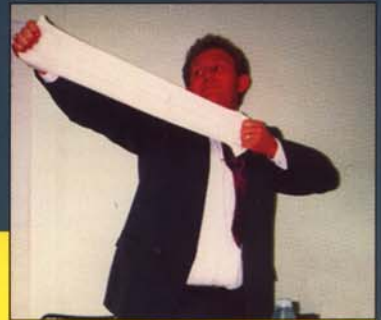
Our 100% liquid applied rubber roofing meets demanding needs.