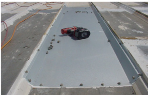
Replace Metal If Necessary