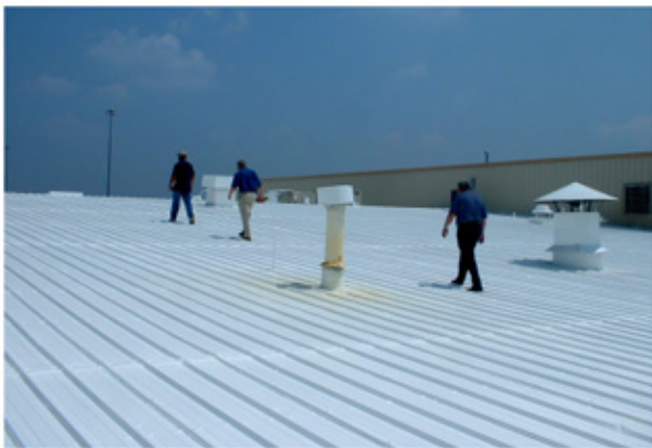
Inspecting Roof After Completion