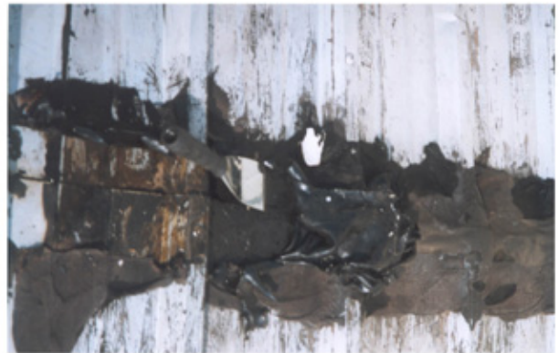
Remove Failed Repair Materials