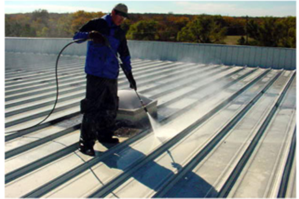
Step 4: Pressure Wash After RustArrestor