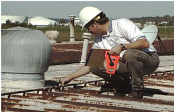
Step 1: Inspect Roof