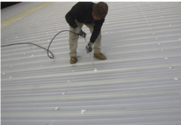
Encapsulate and Seal Fasteners Using Spray Equipment