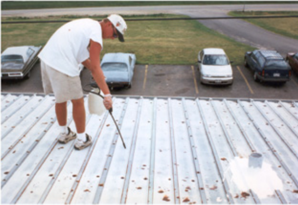
Step 3: Treat Rust with RustArrestor