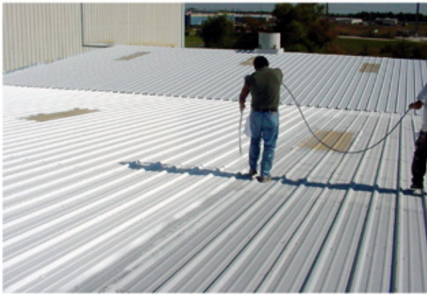
Step 9: Install Finish Coat of Topps Seal Excel