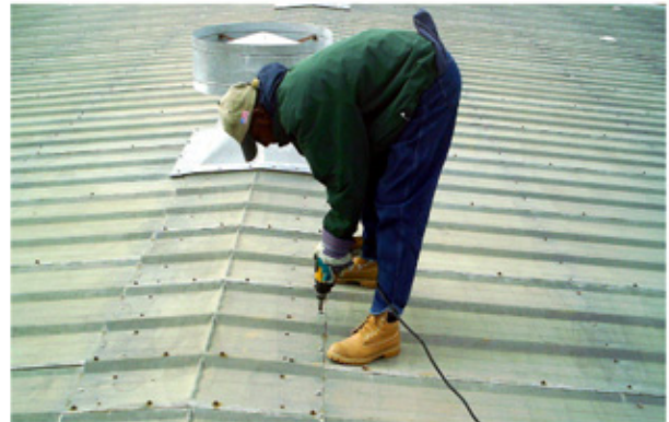
Step 2: Tighten and/or Replace Fasteners