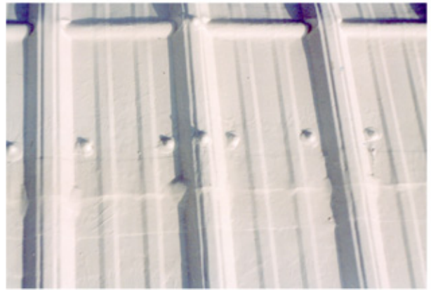
Closeup of Coating Completed Roof Area