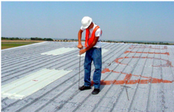
Easy Way to Tighten Screws