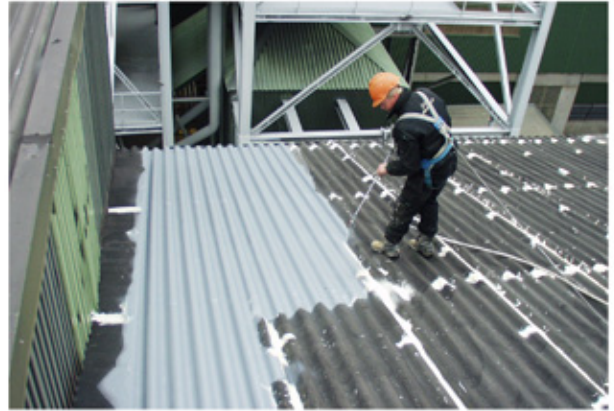
Step 8: Install Topps Seal Base Coat