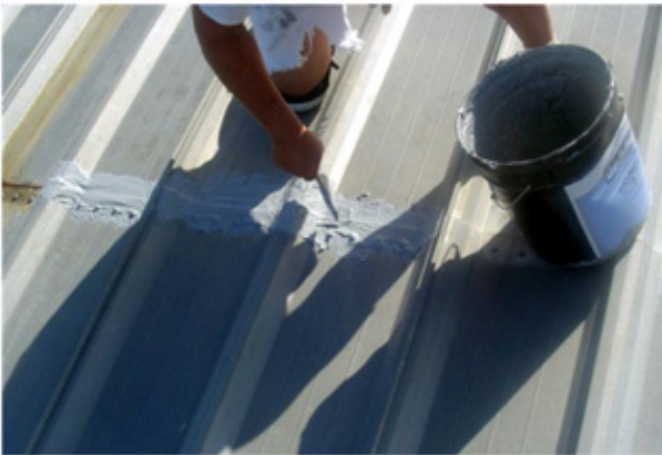
Step 5: Polyprene Repair