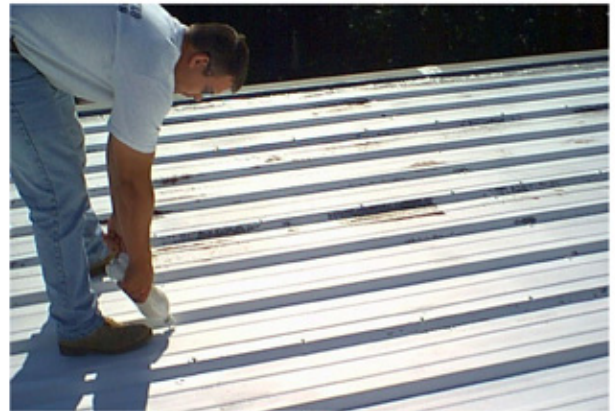
Step 6: Encapsulate and seal fasteners by hand.